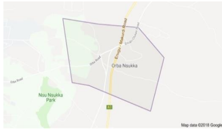
Orba in Udenu LGA